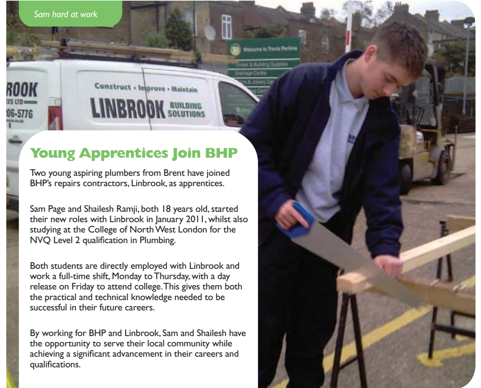
Sam hard at work

If you do install laminate flooring in the property without first receiving written permission, you will be required to remove it.